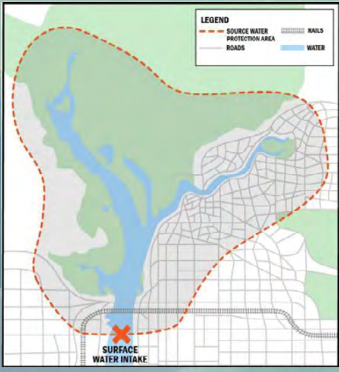
Figure 2 Example of a source water protection area

A source water protection area is the land upstream of a surface water intake, or within the recharge zone of a drinking water well, that is most likely to influence the quality of source water (ANSI/AWWA G300, under revision). The size of the area can vary significantly on the basis of physical, environmental, and regulatory considerations. The 1996 SDWA Amendments required delineation of source water protection areas for each water system. Some systems may have updated their delineations since the original assessments were completed. Figure 2 shows an example of a source water protection area.