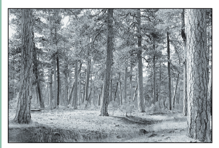
Ponderosa pine stand ca. 1930.

The U.S. Army and the Indian Service began to log big pines in riverside groves and established sawmills on the Williamson River. The first sawmill was constructed in the 1870s and its revenues paid the expenses of Tribal government and supported a medical clinic for the Klamath Tribes. By 1896, timber sales to parties outside of the reservation totaled approximately a quarter-million board