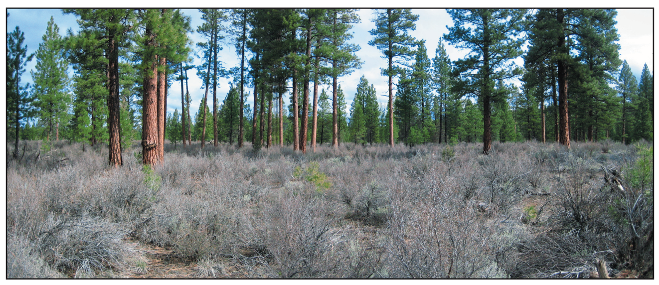
The Wu Amendment to the 2007 Energy Bill

The Klamath River Restoration Agreement includes $500,000 each year for the next ten years to enable the Klamath Tribes to develop the internal capacity to manage